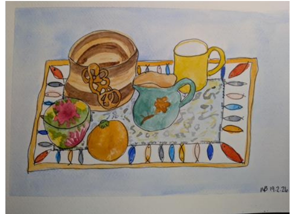
Watercolour still life MB

The group is a friendly and supportive space where you can explore a range of artistic media, including pencil, charcoal, pastels, and watercolours. You are welcome to bring your own materials, and the group leader will provide a helpful list of suggested items to get you started.